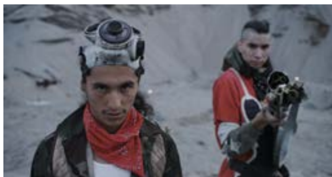
Avant les rues