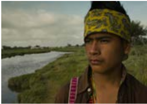
El sueño del Mara'akame