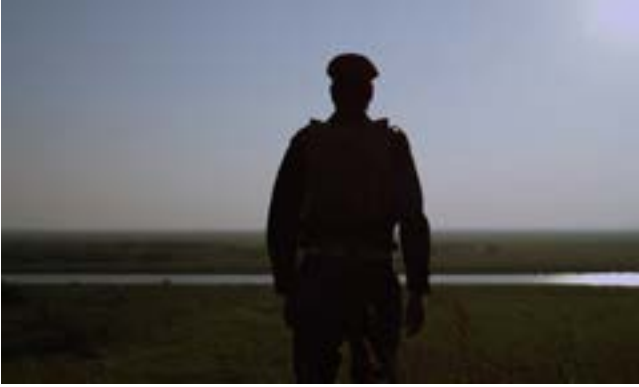
Cree Code Talkers