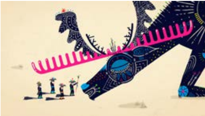
Huichol. El primer amanecer/About the first sunrise