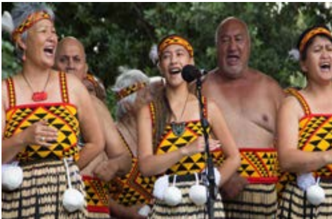
Poi E: The Story of Our Song

National Museum of the American Indian, Rasmuson Theater